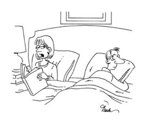
"I don't feel like rubbing your back. Set your phone to 'vibrate,' place it on your back and I'll call you."