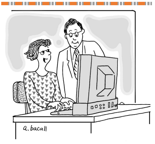
"My password is 'again'. Whenever I forget my password, the computer message says 'Try again'."